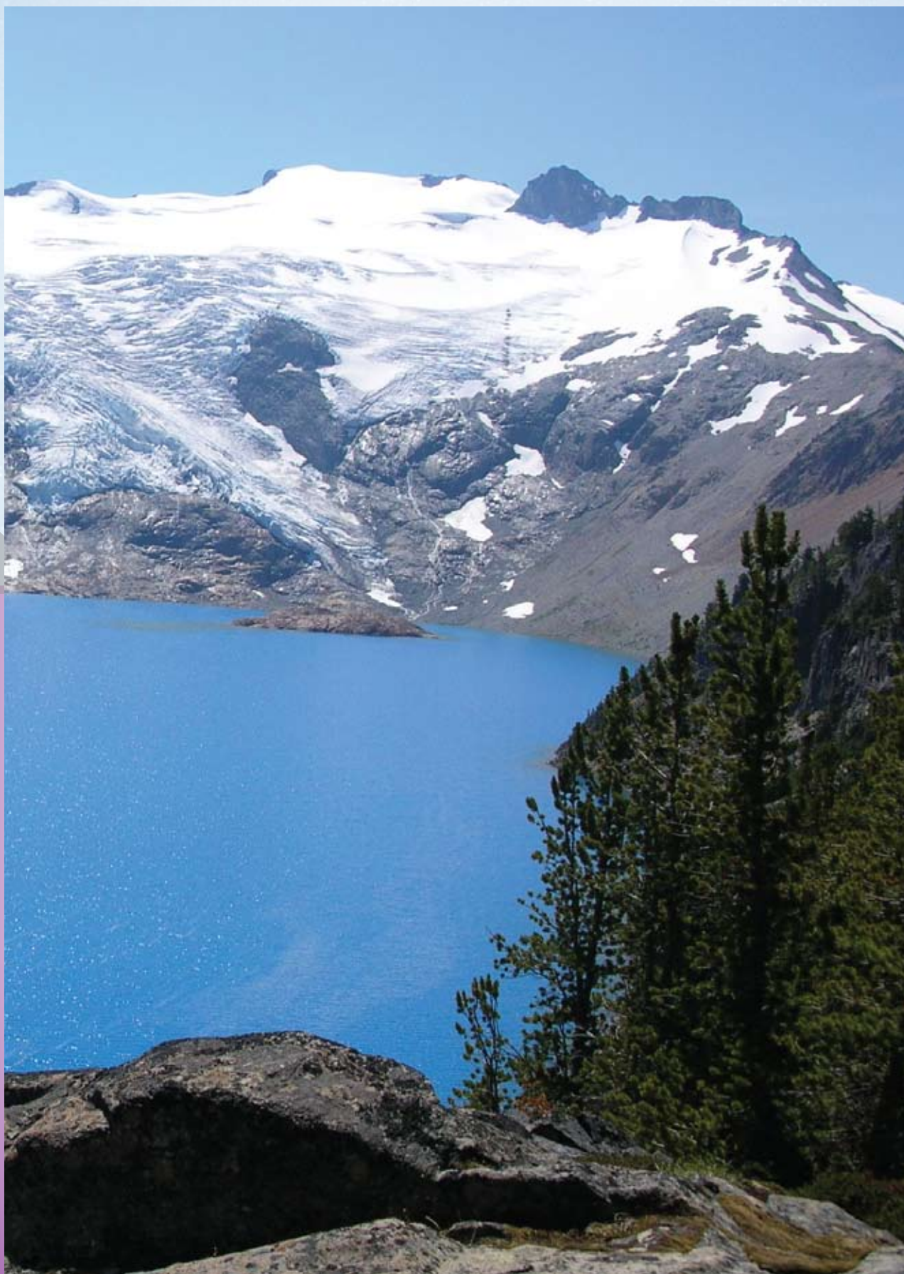
Above and background image: Stein Valley Nlaka'pamux Heritage Provincial Park